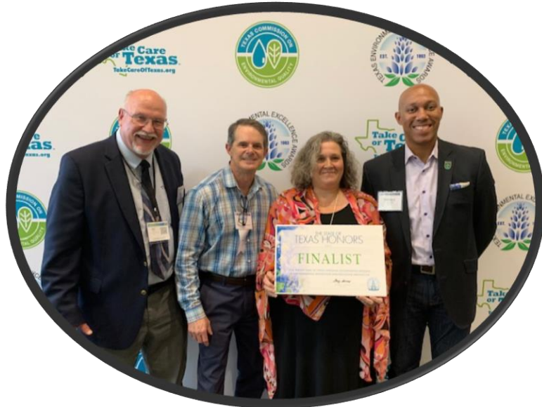
Be Air Smart School Sensor Program honored as a 2023 Finalist by TCEQ at the Environmental Excellence Awards