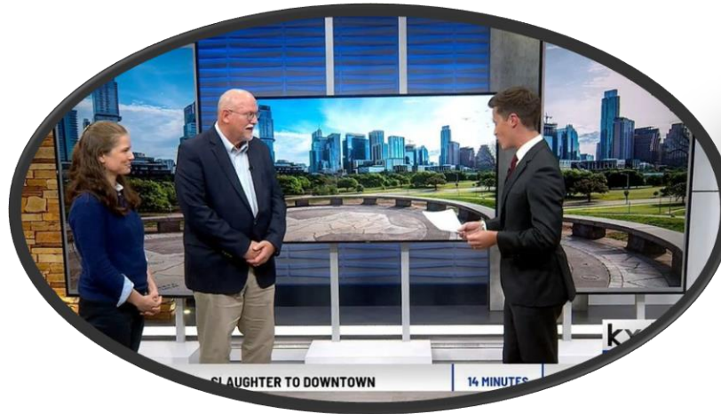
KXAN Interviews for Air Quality Awareness Week and for first Ozone Action Day of 2023