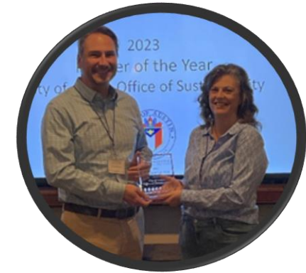
Partner of the Year City of Austin Office of Sustainability