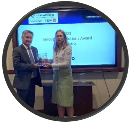
Innovation Solutions Award Cap Metro