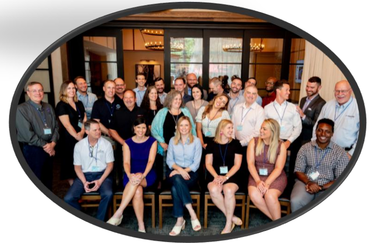
Annual Meteorologists Luncheon