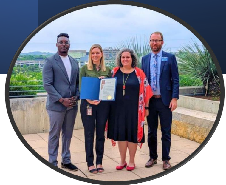
City of Austin Air Quality Week Proclamation